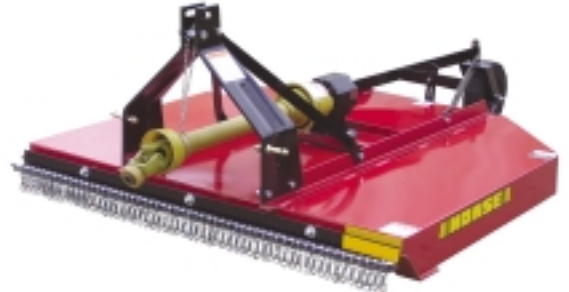
601SC, 602SC, 600C