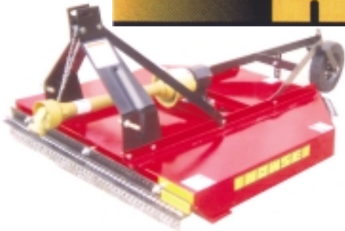
300C, 350C, 400C, 500C